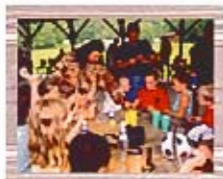
NATIVE AMERICAN CULTURE